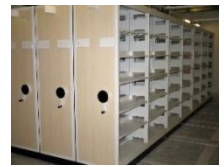
MDF Side Panel